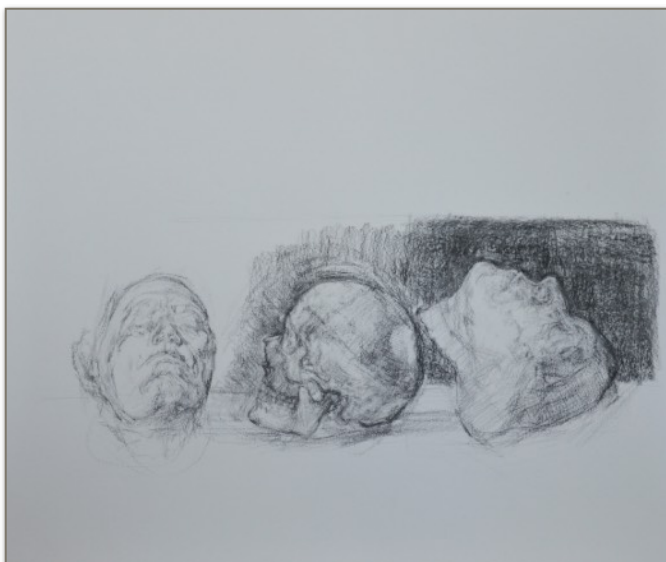
Repose Charcoal on paper